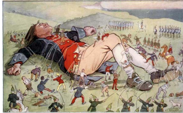
HE FOUND THAT HIS ARMS AND LEGS WERE TIGHTLY FASTNED TO THE GROUND.

Definition: Turnaround, swap, or switch around.